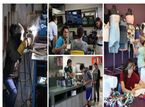
What's driving the growth in career and technical education?