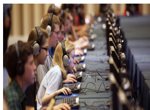
Students get scores, schools learn grades in Sept. (+ Infographic)