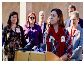
Advocates urge legislators to make sustainable education funding a priority